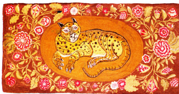
A leopard relaxes on this Vermont-made hearth rug, part of the collection at Cogswell's Grant.