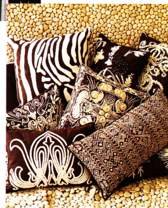
Coast offers a unique mix of antiques, furnishings and decorative accessories like these embroidered, bejeweled toss pillows.